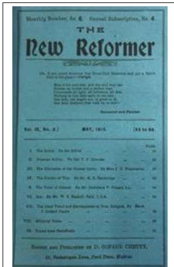
Front cover of The New reformer, May 1915

The magazine was widely popular and received submissions from everyone from Leo Tolstoy, to Abdul Baha, Persian martyr and social reformer, Unitarians from America and Europe and members of the Brahmo Somaj and other sampradayas . 49 In 1910 an Englishman submitted an