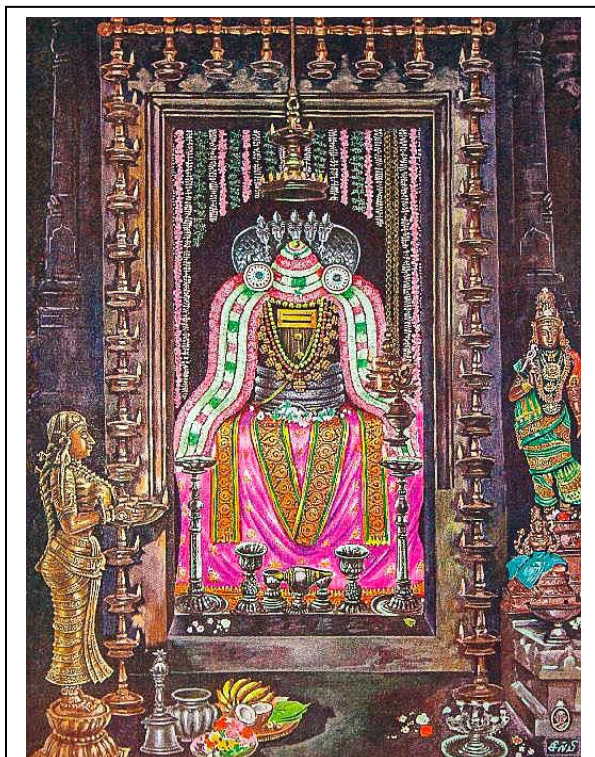
Illustration of the Śiva Lingam at the temple of Lord Mahalingam at Thiruvidadaimarudur, one of the seven major Śiva temples in Tamil Nadu

the city of Thiruvannainallur. The child was known to form Śiva Lingam from the sand and “become absorbed in contemplation”. 27 It was in this state that he was found by a passing Sadhu who gave him the name Meikanda Devar (truth finder). Soon afterward the child began to preach the doctrine contained in Sivajnanabotham , and to attract disciples. Meikanda Devar and his disciples produced the fourteen works which became the Śaiva Siddhanta Shastras. 28 The clearest distinction between Śaiva Siddhanta and other forms of Śaivism is the relative absence of the grim imagery associated with more Northern traditions, the image of Lord Śiva as an ashen sadhu contemplating skulls in the cremation grounds is largely replaced by the cosmic primacy of love, here we see an image of Śiva