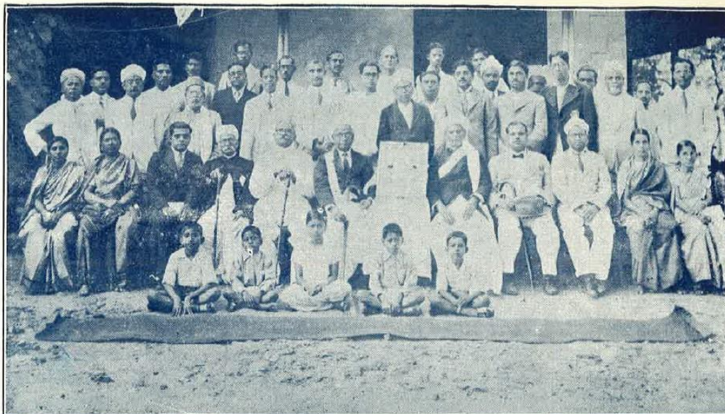
250th Anniversary of the Birth of Emanuel Swedenborg Madras Celebration 29th January 1938

Like the sand which unites with the wax when it is melted [Śiva] being closely joined to the world (of souls) is in inseparable union with it. Because He enters my solitary soul, I can now say 'I am the world'. 1 ~Meikanda Deva