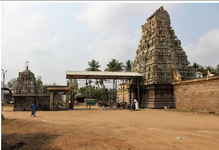
Kripa Pureeswarar Temple complex at Thiruvannamalai

Swedenborg and Śaiva Siddhanta with the most ancient history of the Dravidian people. He references several Western ethnologists who describe the indigenous people of South India as, “early advanced in civilization,” that they “were great maritime traders and carried on their trade with Asiatic and European countries