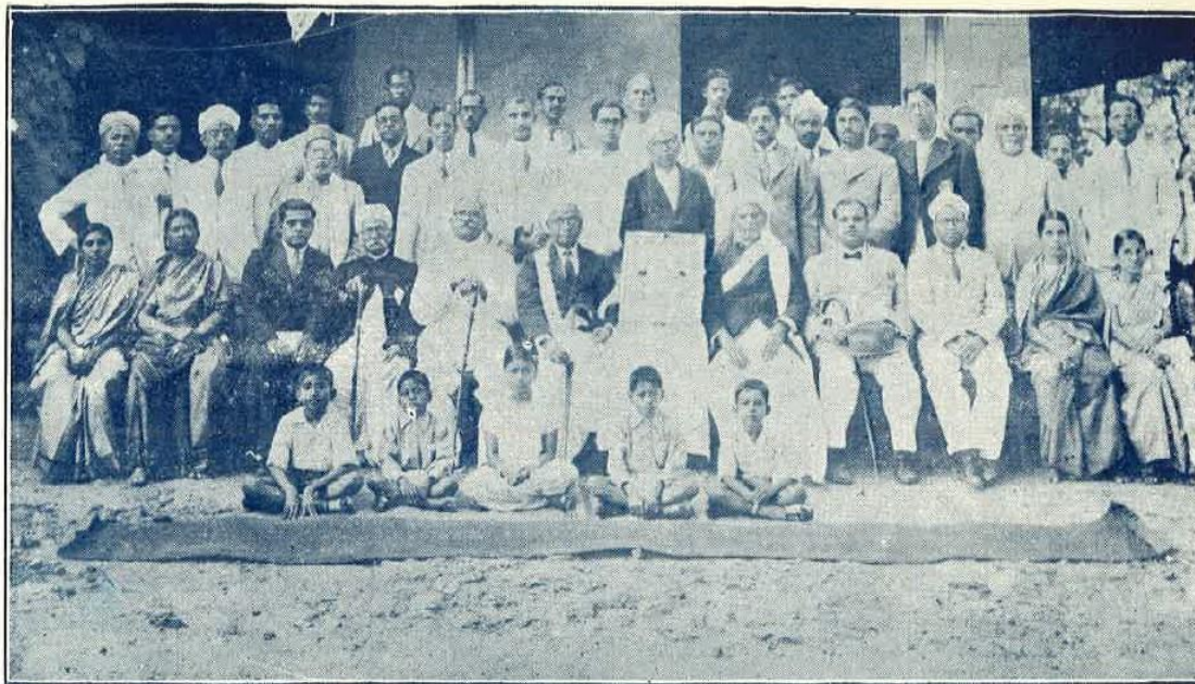
250th Anniversary of the Birth of Emanuel Swedenborg Madras Celebration 29th January 1938